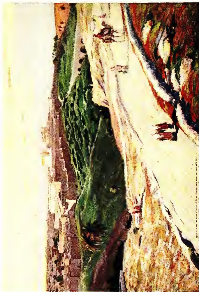
Reproduction of the painting 'Rain, Steam, and Great Central Railway' by J.M.W. Turner.